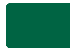
7332 DARK GREEN