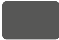
G688 FELTEC® ZINC PHOSPHATE LIGHT GREY