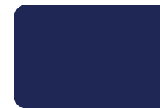
7383 WIRA BLUE