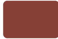
G388 FELTEC® RED OXIDE

FELTEC® OXIDE PRIMER is an alkyd-based and long term anti-corrosive primer formulated for application over wire brushed/power tooled surfaces. It can be over coated with most alkyd undercoats and finishes such as FELTEC® FEDERAL UNDERCOAT , FELTEC® MICACEOUS IRON OXIDE , FEDELUX® Gloss Finish.