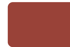
7359 IMPIAN RED