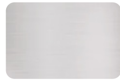
MO 250 ALUMINIUM PAINT

FELTEC® ALUMINIUM PAINT is designed for application on gates, fences, lamp post, and general wood surfaces.