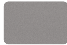
9811 MIO SILVER

FELTEC® MICACEOUS IRON OXIDE (MIO) is formulated for use in high humidity and mild chemical environment. Ideal as intermediate coat or finishing coat for steel bridges, cranes, pipelines, storage tanks, and other general uses over metal surfaces. It has a luxurious metallic finish, suitable for both interior and exterior use.