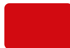
0402 SIGNAL RED