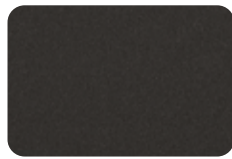
9813 MIO GREY BLACK