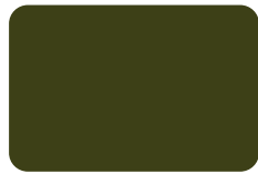
G288 FELTEC® ZINC PHOSPHATE GREY GREEN

FELTEC® ZINC PHOSPHATE PRIMER is an alkyd-based and long term anti-corrosive primer formulated for application over wire brushed/power tooled surfaces. It can be over coated with most alkyd undercoats and finishes such as FELTEC® FEDERAL UNDERCOAT , FELTEC® MICACEOUS IRON OXIDE , FEDELUX® Gloss Finish.