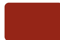
0882 INDIAN RED