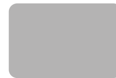
1457 MISTY GREY