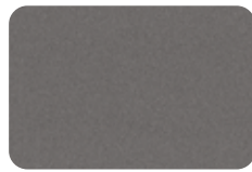
9812 MIO DARK GREY