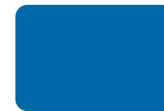
0632 BRIGHT BLUE