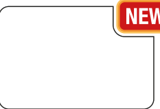
1K ACRYLIC ROOF CLEAR UV+