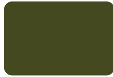
A588 FELTEC® GREEN OXIDE