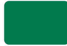
1458 DARK GREEN